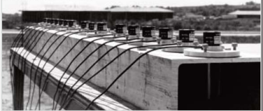
LI-200SA Pyranometer Sensor

The spectral response of the LI-200SA does not include the entire solar spectrum (Figure 1), so it must be used in the same lighting conditions as those under which it was calibrated. Therefore, the LI-200SA should only be used to measure unobstructed daylight. It should NOT be used under vegetation, artificial lights, in a greenhouse, or for reflected solar radiation.