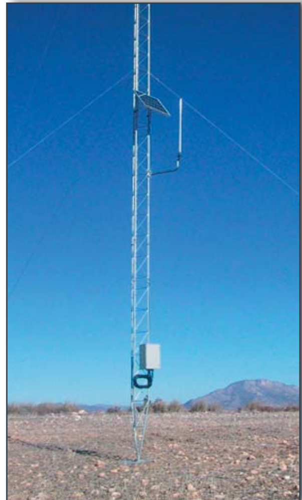
METEODATA-3000C Data Logger, a high gain GPRS transmitting antenna and a Solar Panel, mounted on the met tower