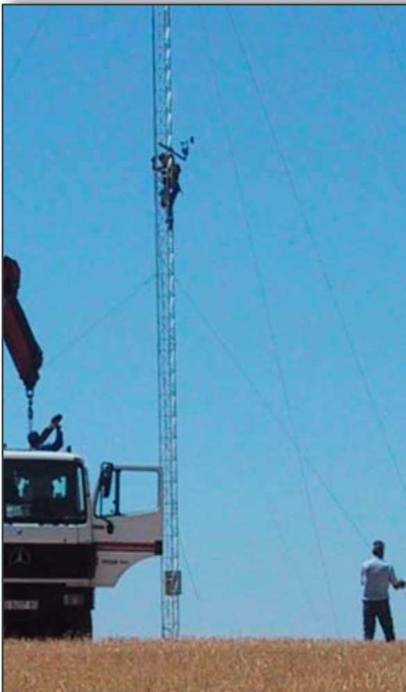
Mounting the wind sensors and the Data Logger / Transmitter, on a 60-meter stainless steel meteorological tower

Our Remote Data Logger Model METEODATA-2000/3000C Series incorporates a built-in GPRS or CDMA modem, that also allows a user to call into the logger and view live data at the site, as well as to download data site conditions and even to change data collection parameters or to program new alarms, all remotely from the user's computer.