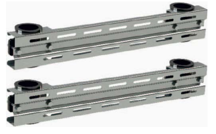
ENCLOSURE MOUNTING EM 522 (SET OF 2)