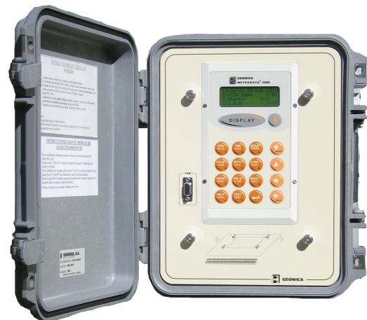
METEODATA / HYDRODATA

Datalogger with integrated comms (3G / GPRS, Line, Radio or Satellite)